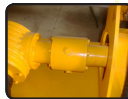
• Freewheel on sleeve