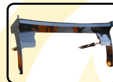
• Hydraulic pushing frame